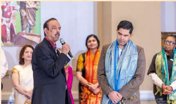
State Rep. Ranjeev Puri