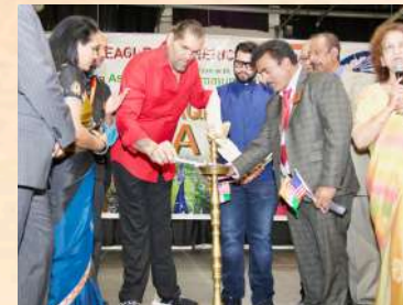
The Great Khali

INDIA LEAGUE OF AMERICA - MICHIGAN (ILA)