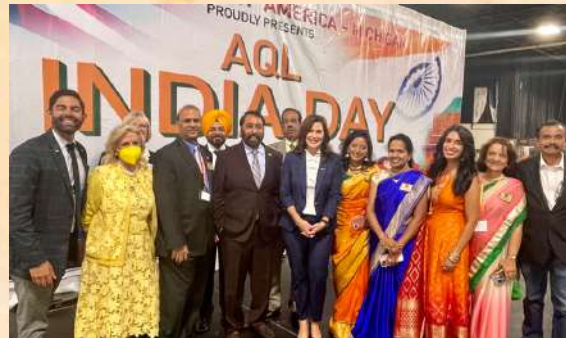
Governor Gretchen Whitmer