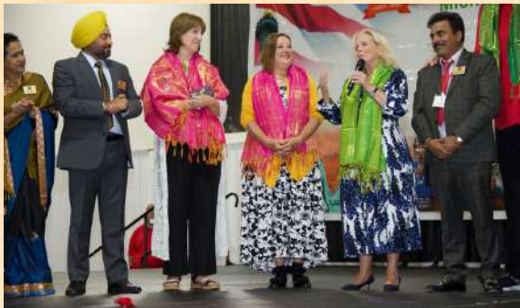
US Rep. Debbie Dingell