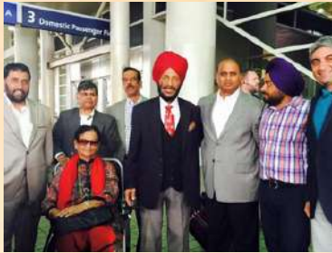
S. Milkha Singh