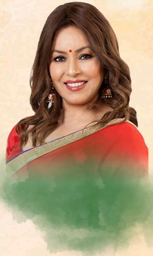
Mahima Chaudhry (Chief Celebrity Guest)