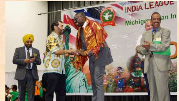
Lt. Governor Garlin Gilchrist II