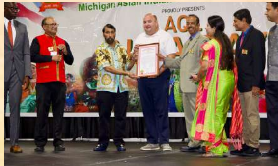
State Senator Mike Webber